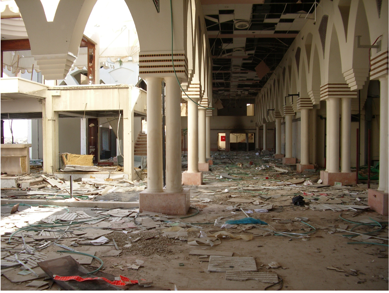
Interior of terminal building, Gaza International Airport, 4 December 2006

The Palestinian Civil Aviation Authority estimates the cost of the recent damage to the terminal, hangars and surrounding buildings at more than $6.4 million and expects this figure to rise significantly when more comprehensive assessments have been carried out. The latest destruction comes in the wake of damages worth $24.3 million to the airport during IDF incursions between 4 and 15 December 2001.