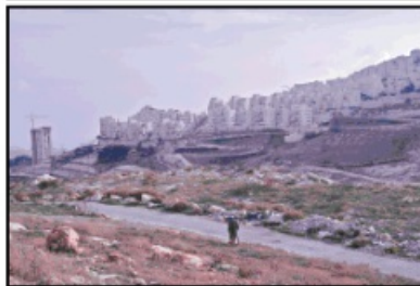
Har Homa settlement