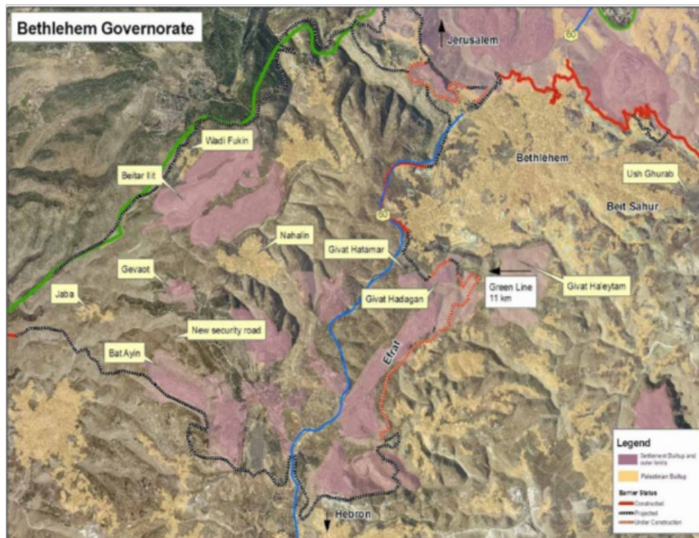
Map: Shrinking space in Bethlehem