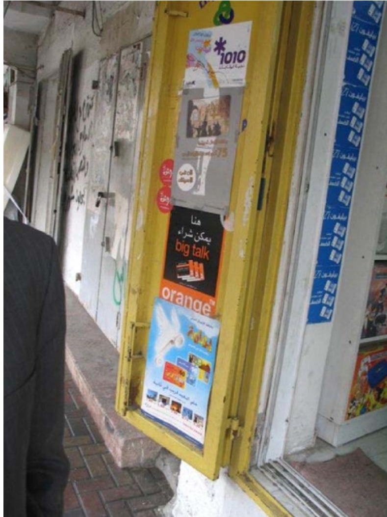
The photo displays advertisement material for Israeli operators at a Jawwal sub-dealer in downtown Qalqilya. The photo was taken on 11/07/07, in the presence of the World Bank mission.