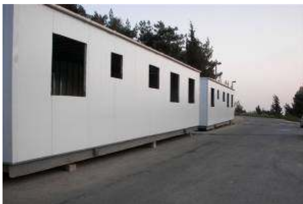
New Caravans set up in Psagot