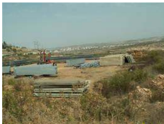
Workshop for Caravans' Construction in Elkana