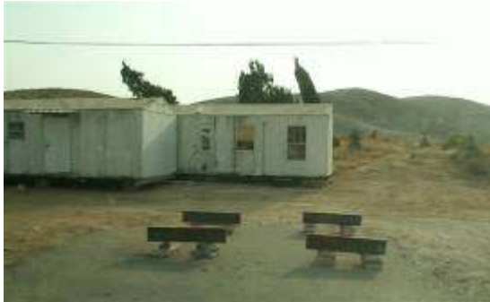
New Caravns in Giv'at Sali't outpost