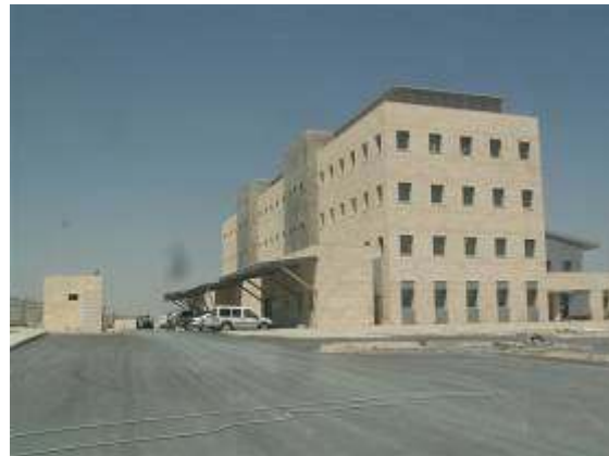
The Police Station built in E1