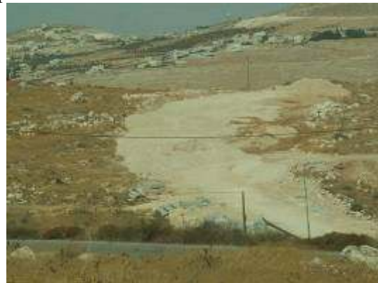
Preparing the infrastructure for building in the Tko'a B-C Outpost