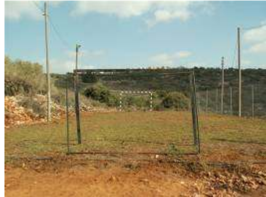
New football field in Yair Farm outpost