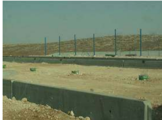
The complex built in Susiya