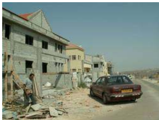
The "Nof Oranit" neighborhood, the construction of c. 65 Housing Units is underway