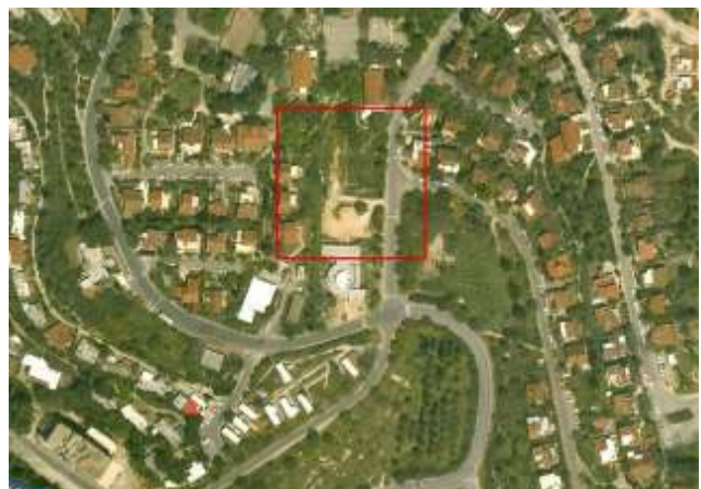
Kedumim, April 2007