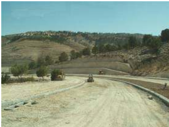
The "highway" to the police station in E1

Peace Now believes that the road was meant to allow Israel to feel it was "taking care of the Palestinians' welfare," which is like a person boasting he gave a wounded man a bandage, after cutting off the man's hand himself.