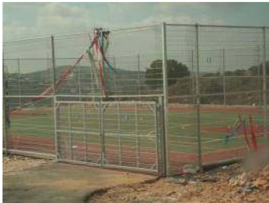
New basketball field in the outpost of Bruchin