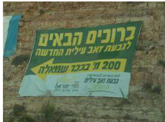
"Pninat Ha'ayalot" (Giva't Ze'ev Illit) – new project west of Giva't Ze'ev