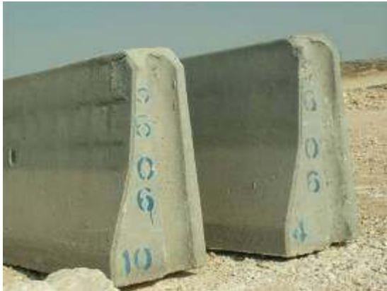
Defense Ministry Marking

Where did the security fence dismantled in the southern Hebron Mountain go? Following an HCJ ruling the IDF dismantled 40 km of a concrete rail built wastefully along highway 317 in the southern Hebron Mountain. The settlement of Susiya knew how to take advantage of it: recently construction of a large complex (apparently a sports complex) has been undertaken in the settlement, with parts of the dismantled concrete rail serving as foundations for the complex