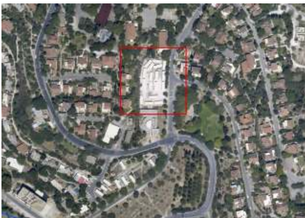
Kedumim, August 2007 – Compound of new Caravans