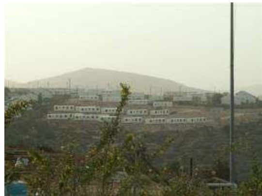
The new caravans in Eli