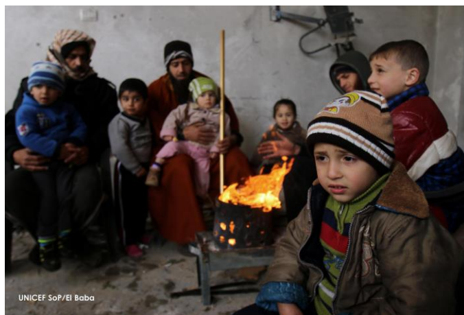
IDP children and families strive to stay warm during the winter storm in Gaza