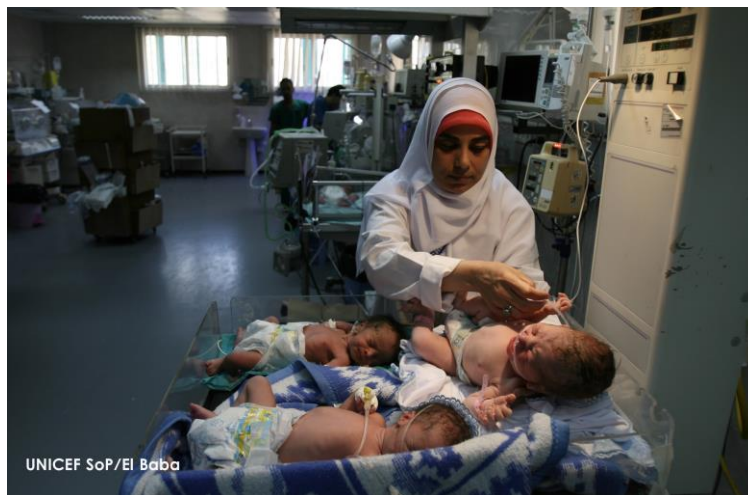
Hospital's neo natal intensive care unit administers an antibiotic dose to a premature baby. UNICEF has equipped the ICU and supplied MoH with medical consumables and drugs.