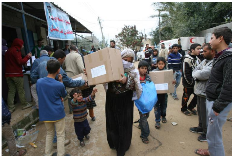
23 February 2015 –In Al-Mughraga Area in the middle of Gaza Strip, UNICEF with the help of its partner PRCS distributed blankets, clothes and hygiene kits to 99 families who were affected or displaced as a result of the flooding of the Wadi Gaza stream (top and bottom photos)