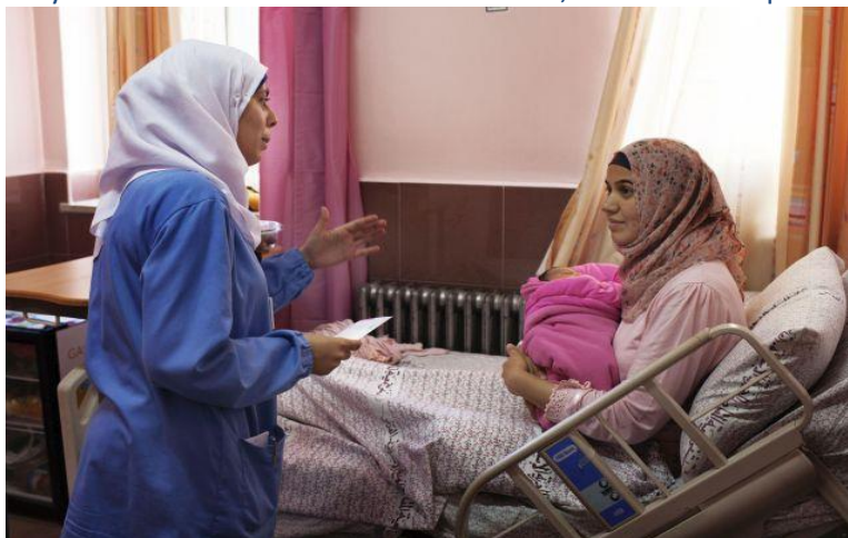
East Jerusalem - Nurse gives instructions on breastfeeding to a 26-year old Palestinian woman at Abu Ter, Makassed Hospital

In Gaza, during the reporting period, 732 mothers and new-born babies received postnatal home visits as part of a programme in collaboration with the Ministry of Health and NECC. Since January 2015 a total of 4,220 mothers and new-borns have been reached by the programme. A total of 410,000 vaccines that will cover the needs of 135,000 children were delivered to the Ministry of Health in September. Around 510 awareness sessions on infant, young child feeding practices were held