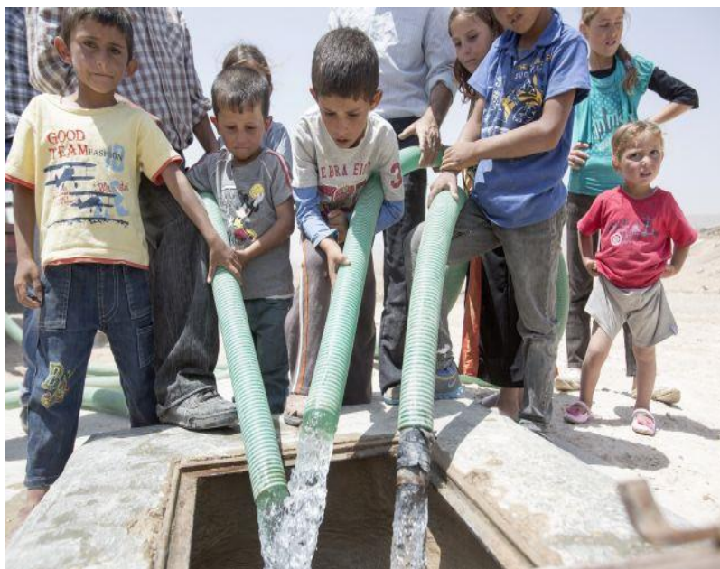
El Majaz, South Hebron – Children filling a water tank, part of the water distribution project in the West Bank

This month UNICEF continued to provide assistance to CMWU through the WASH Cluster for the distribution of extra amounts of fuel to critical WASH facilities as a result of the frequent and extensive power cuts particularly in Rafah and Eastern villages. Installation of two new generators is ongoing for two water wells in Rafah benefiting around 20,000 people.