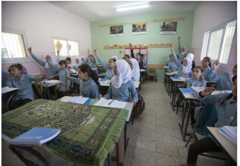
Bethlehem Khader School - Children participating in class in a school that was rehabilitated by UNICEF

In the West Bank, protective accompaniment is ongoing for approximately 3,800 children (30% girls) and 300 teachers to enable access to schools timely and safely through protective presence in the field. Twenty six (26) schools and checkpoints in Hebron, Bethlehem, Nablus, Jerusalem and Ramallah will be monitored during the 2015-16 school year.