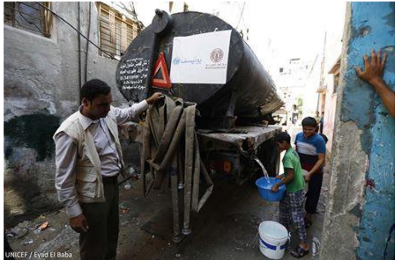
UNICEF and partners delivering water.