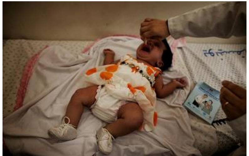
An infant being immunised against polio.