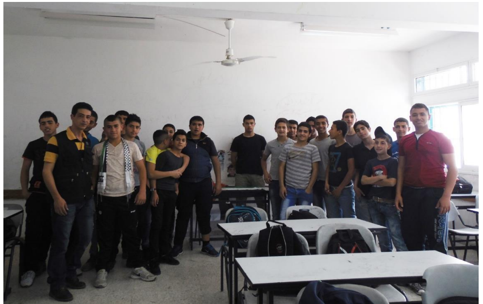
Boys from Aida School attend the “Know your rights” sessions organized in coordination with UNRWA.

In partnership with the United Nations Relief and Works Agency for Palestine Refugees in the Near East (UNRWA), UNICEF identified six UNRWA schools that will participate in the “Know your rights” programme. The purpose of this initiative is to sensitize children about their rights, and help them build coping strategies and resilience against violence. In April, 1,200 children from two UNRWA schools (Shu’fat and Aida Girls and Boys, grade 7-10) attended the “Know your rights” sessions. This programme will continue in May in order to reach the remaining four UNRWA schools. This project prioritizes children and adolescents living in the refugee camps most affected by episodes of violence with the Israel Defense Forces (IDF), including cases of stabbing carried out by young refugees.