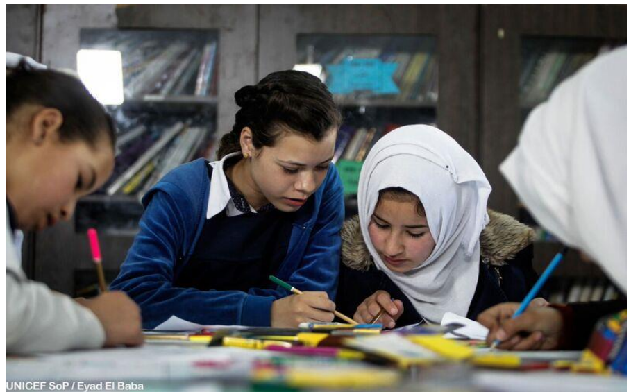
School children from Abu Tamam basic school in Gaza benefit from improved access to education through the UNICEF-supported initiatives.

The Adolescent Development and Participation programme (ADAP) continued to provide adolescents with trainings on social entrepreneurship and life skills, and youth-centred campaigns promoting dialogue on conflict resolution, as well as peace and social cohesion. In April, 34 adolescents from the West Bank (70% girls) have benefitted from the ADAP programme through the provision of trainings on how to design and coordinate youth-led initiatives in their communities. 1 The training was provided in coordination with the national NGO Tamer. In Gaza, in partnership with the national NGO Ma'an Development Centre, UNICEF supported the organization of 39 school-based awareness raising initiatives, sensitizing 230,254 adolescents on a wide range of adolescents' rights and issues, including: child marriage, domestic violence, and school drop outs.