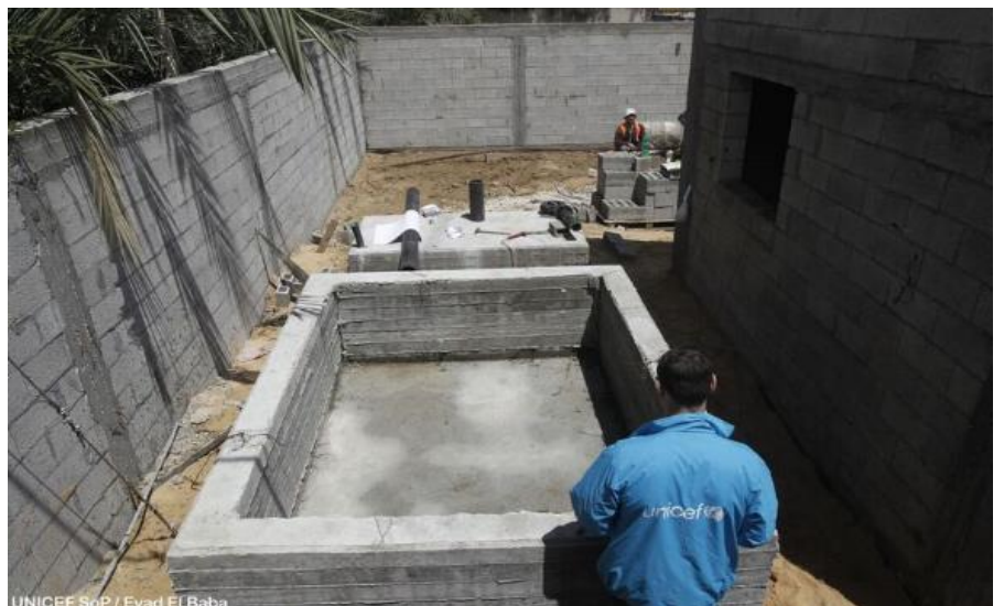
UNICEF field staff visits the water well of Dier AlBalah, in Gaza’s middle area, to supervise the status of construction works.

Progress was made to reconstruct the three wells in Khan Younis, Maghazi and Dier AlBalah which had been destroyed during the last war in Gaza. In coordination with CMWU, excavation works were completed in Khan Younis. 2 Electromechanical works, including the installation of well pumps, have started in all three wells and will continue until July-August 2016.