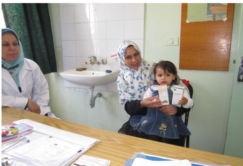
A mother and her child at the Sheikh Radwan primary health care center (Gaza city) receive essential medicines UNICEF distributed in coordination with the Ministry of Health.

To address priority needs identified in the Micronutrient Survey Report 6 , UNICEF supported the Ministry of Health through the procurement of micronutrients supplements for Gaza and the West Bank. These supplies were distributed in April to 38 primary healthcare centers, in partnership with the national NGO Palestinian Medical Relief Society (PMRS) and the Ministry of Health. In April, 21,841 pregnant and lactating women (14,341 in Gaza and 7,500 in the West Bank) received micronutrient supplementation in all 550 targeted health facilities. In addition, 9,597 under-five children (49% girls) benefitted from the distribution of micronutrients supplements, including Vitamin A.