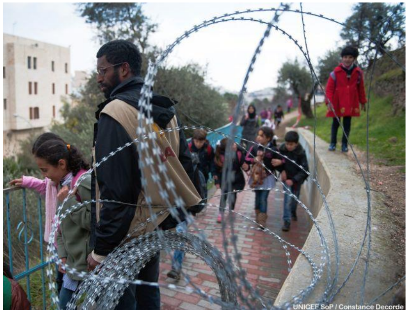
An EAPPI volunteer walks Palestinian students past barbed wire outside the Cordoba school in the Old City of Hebron, as part of UNICEF's protective presence and accompaniment programme.

In January, the Adolescent Development and Participation programme (ADAP) supported 1,302 adolescents with skills development and civic engagement projects through its partners Al Nayzak, INJAZ, PalVision, Tamer, Save Youth Future Society and Ma'an Development Center. Since the beginning of the project in January 2015 a total of 45,039 adolescents (56% female) have benefited from the programme.