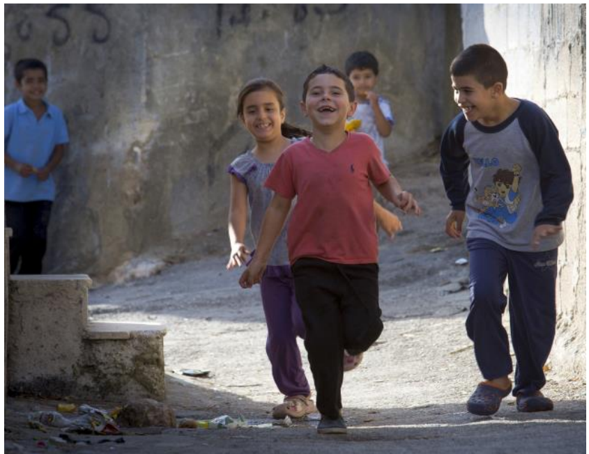
East Jerusalem – Children in in Silwan neighborhood who receive psychosocial support services through UNICEF programmes. Many children have been arrested in this neighborhood during continuous clashes around checkpoints.

In January, the Working group on Grave Violations against Children provided inputs for the Secretary-General's Annual Report on Children and Armed Conflict for 2015. In the past year, the Working Group on Grave Violations documented 2,247 violations, affecting over 39,712 children.