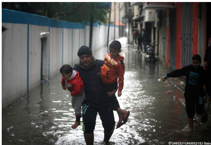
A Palestinian father carries his children through a flooded street during the winter storm in Rafah, Gaza, on 25 January 2016. Seven mobile water pumps, donated by UNICEF, are being used by Gaza's Coastal Municipalities Water Utility (CMWU) to clear the flooded areas.

UNICEF in coordination with OCHA and UNRWA provided assistance through the WASH Cluster in distributing of 55,000 litres of fuel to critical WASH facilities, particularly in Rafah and Eastern villages of the Gaza Strip.