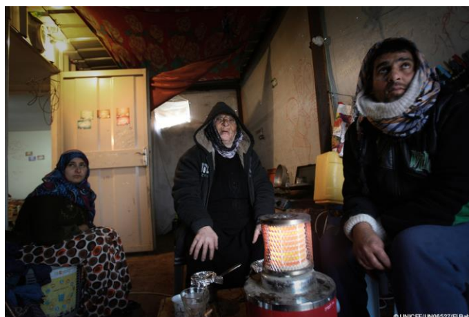
Gaza - A Palestinian family around the heater in their temporary housing in Khuzaa' village. UNICEF provided Gaza hospitals with the essential drugs needed to manage winter-related diseases.

During the month of January, 8,456 women increased their knowledge related to breast feeding and complementary feeding of young children, through breast feeding and awareness raising sessions.