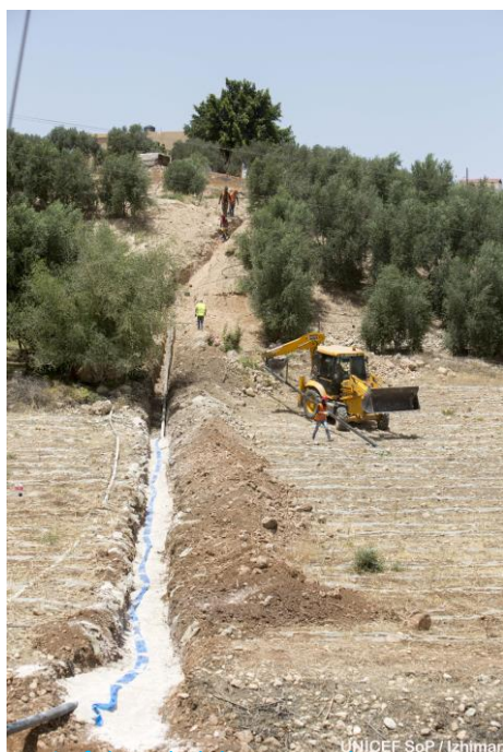
95% of the rehabilitation and extension of water networks with ACF in Tubas, West Bank, has been completed.

Data provided by the Working Group on Grave Violations (WGGV) against children documented 516 incidents affecting at least 1,700 children since the beginning of the year.