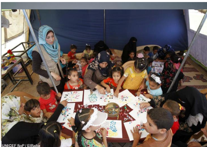
Mothers, children participate in activities at a mobile family center in Juhor Ad Dik, a vulnerable community located next to the Access Restricted Area in Gaza.

During the reporting period, the 28 Family Centres, supported by UNICEF, Ma'an and Tamer, reached 377 children with psychosocial support, including both group and individual counseling in Gaza. Since January 2016, the programme reached 31,755 children (49% girls). Additionally, 1,880 children received child protection services, such as life skills, case management and child/parent interaction programs. From January to May, 6,094 children (49% boys) benefited including 1,030 vulnerable children who received case management services. UNICEF supported the organization of awareness raising sessions in partnership with the Family Centres. As a result, 2,951 caregivers (52% male and 48% female) gained knowledge on protection of children and positive discipline.