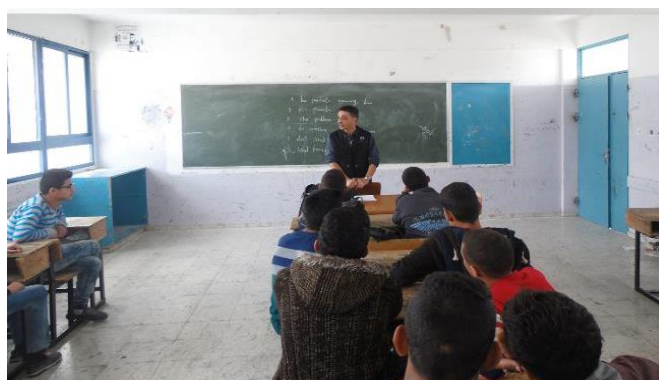
Boys from Al Arroub School attend the "Know your Rights" sessions organized with UNRWA.

Six UNRWA supported refugee camps, most affected by clashes and violence with the Israeli Defense Forces (IDF), were identified and involved in a "Know your Rights" programme. The objective of this initiative is to raise awareness among children about their rights, and support them to build coping strategies and resilience against violence. In May, 476 children (363 boys, 113 girls) from Qalandia, Jenin, Jalazon, and Al Arroub refugee camps attended the sessions. Children shared their concerns and experience about the lack of security and safety, repeated episodes of violence, and arrests of young boys.