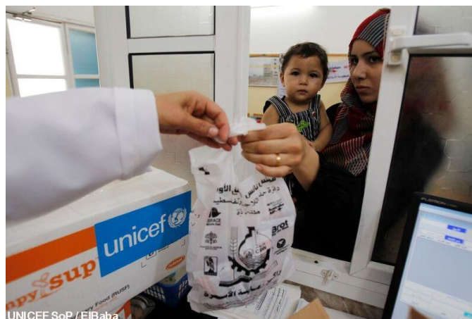
A mother receives supplementation for her child at the Al Daraj Clinic run by national NGO (NECC in the Gaza Strip).

UNICEF continued to provide essential, life-saving supplies to the public health facilities in Gaza and the West Bank. In Gaza, UNICEF supplied 351,440 bottles of normal saline infusion which will serve up to 150,000 women and children under five to the Ministry of Health (MoH). In the West Bank, the Ministry of Health used UNICEF-procured supplies to provide medical treatment to 26,193 of women, including under five children (70% of beneficiaries). In May, 14,341 pregnant and lactating women received micronutrient supplementation at the primary and secondary healthcare level. 2,598 under five children (50% girls) were administered iron drops to prevent anemia.