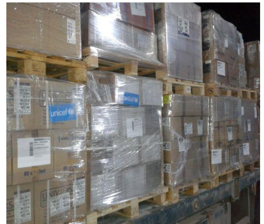
Gaza City – 186 pallets of essential drugs delivered by UNICEF to the Ministry of Health in Gaza.