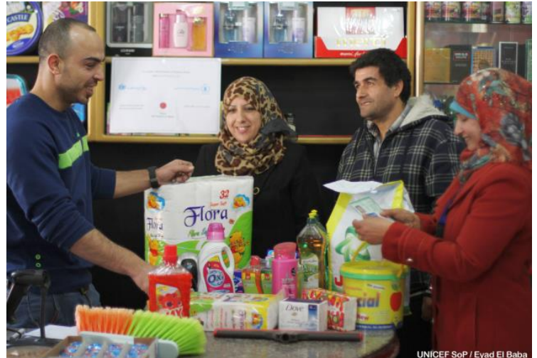
Gaza City – Palestinian families receive essential hygiene products in a shop as part of the UNICEF-WFP e-voucher programme in February. The joint programme has benefited more than 8,000 families in Gaza.

Also in the West Bank, UNICEF distributed 13,529 packs (0.8 ton) of iron & folic acid tablets to the Ministry of Health that benefited more than 10,000 people.