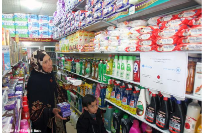
Gaza – Palestinian families redeem e-vouchers for school children. Since the beginning of the joint project between UNICEF and WFP more than 8,000 school children have benefitted from education supplies such as school uniforms, shoes and winter clothes.

In February, the Adolescent Development and Participation programme (ADAP), through its partners Al Nayzak, INJAZ, PalVision, Tamer, Save Youth Future Society and Ma'an Development Center supported 839 adolescents with skills development and training in implementing and leading initiatives addressing issues of conflict, violence, and social cohesion. Since the beginning of 2016 a total of 2,141 adolescents (43% female) have benefited from the programme.