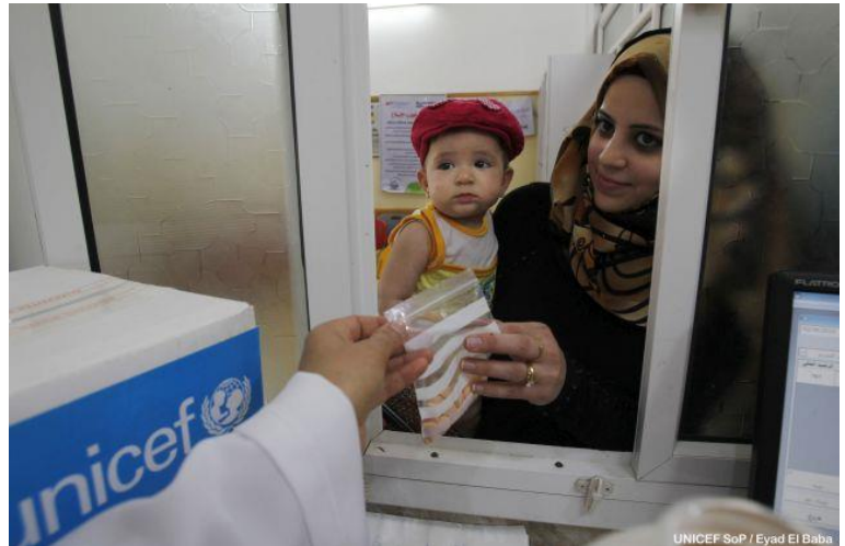
Gaza - A mother receives multivitamin pills at the Al Daraj Clinic in Gaza City

The main challenge for the Health and Nutrition section are delays in receiving equipment and materials as well as waiting for clearance for materials entering Gaza.