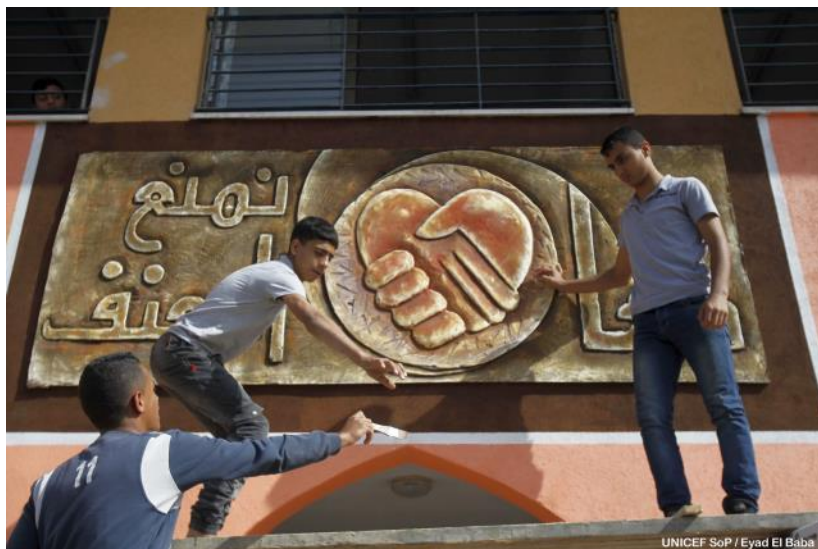
Gaza City - Adolescents participate in an anti-violence campaign as part of the Adolescent Development and Participation programme (ADAP)

Some of the challenges are high unemployment and lack of opportunities for youth, double shifts in many schools in Gaza causing insufficient instruction time and continuous harassment of children on the way to school in West Bank during the school year.