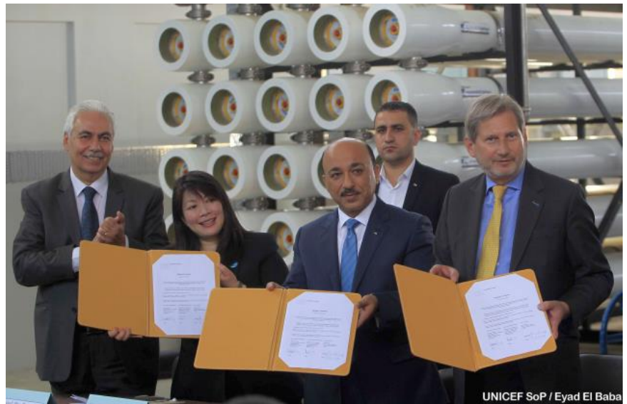
Gaza - EU Commissioner Johannes Hahn visited the seawater desalination plant on 14 June 2014 and announced an additional funding of €10 Million for the second phase.

The major challenges in WASH are low level of funding received and long processes for clearance regarding WASH materials, especially materials destined for projects in Gaza.