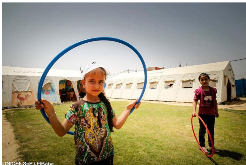
Gaza - Girls participate in activities at a mobile family center in Juhor Ad Dik, a vulnerable community located next to the Access Restricted Area

As of June, members of the Mental Health & Psychosocial Network Working Group (MHPSS) and