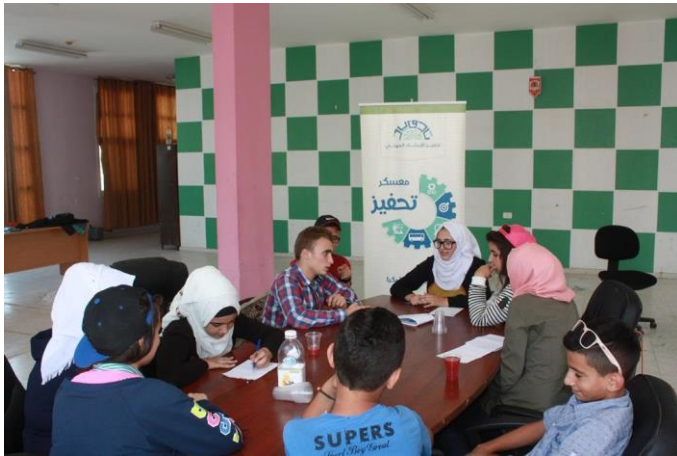
Adolescents developing their entrepreneurial project ideas

UNICEF continued to facilitate access to education in high risk locations in the West Bank during the reporting period, particularly Area C, by providing protective presence to 4,334 children and 333 teachers on their way to and from schools.