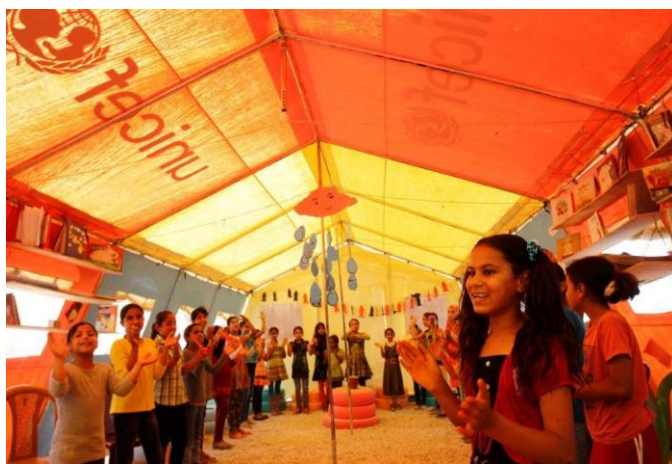
A mobile family centre in Gaza

Awareness raising sessions on the risks of Explosive Remnants of War were held for 2,684 children through family centres. A total of 151,184 children and 11,200 caregivers gained new knowledge since January, including through governmental schools.