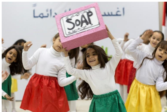
Figure 1 School girls dance at the end of the event marking Global Handwashing Day at the MoEHE in Ramallah

In Gaza, a total of 3,408 people improved their drinking water capacity as well their domestic water capacity by receiving 568 and 413 Polyethylene (PE) water storage units, and 3,600 people received chlorinated tankered drinking water. Furthermore, 3,605 m3 wastewater was vacuumed from cesspits at risk of flooding, 29 solid waste 1m3 containers were provided to municipalities in Gaza, and 48 environmental health and hygiene campaigns were conducted.