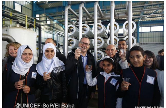
Figure 3 UNICEF RD Geert Cappelaere tasting one of the first glasses of safe drinking water produced at the EU-funded seawater desalination plant established by UNICEF.

The security level remained unchanged (low in Jerusalem and Israel, moderate in the West Bank and substantial in Gaza). Nationalistic violence by Palestinian and Israeli civilians continued; there were more than 260 clashes between Palestinian and ISF resulting in the death of 13 Palestinians and 2 Israelis with injuries of more than 120 Palestinian and more than 45 Israelis. More than 10 stabbing cases and more than 10 armed conflict with stone and Molotov cocktail throwing were reported in Jerusalem and the West Bank during the fourth quarter 2016 5 . The recently adopted UN resolution 2334 on Israeli settlement building in the West Bank and East Jerusalem triggered strong reactions.