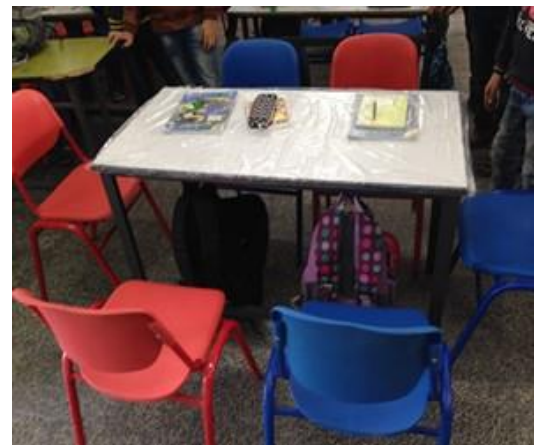
Figure 2 New classroom furniture delivered to schools in Gaza in November 2016

Overall progress towards the Cluster objectives has been limited due to a lack of funds for the humanitarian education response. Only USD 6.3 million out of the USD 18.0 million total HRP education requirements were funded.