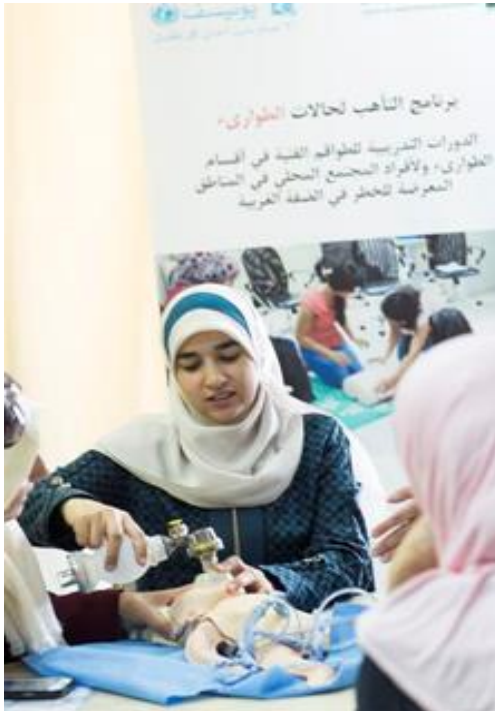
An emergency preparedness training including first aid and basic life support for community members in the West Bank

UNICEF continued to provide emergency health care supplies to the Ministry of Health (MOH) in Gaza, including drugs and medical consumables. A total of 136,269 women and children benefitted during the reporting period. A total of 16,763 women gained new knowledge on breastfeeding and complementary feeding in both primary health facilities and hospitals in Gaza. The micronutrient supplementation delivered through MOH services to pregnant and lactating mothers, in the West Bank and Gaza, reached a total of 65,255 mothers and 58,566 children under five (50% girls) during the reporting period. A total of 14,237 women and 9,257 children under five (50% are girls) were screened for malnutrition disorders, of which a total of 837 children (more than 60% females) were found malnourished and were treated during the third quarter, with therapeutic food provided by UNICEF.