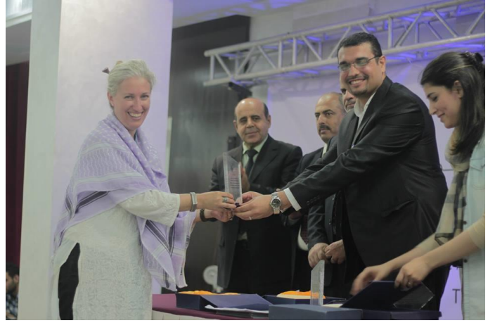
Gaza City, 9 June. Closing ceremony of the second phase of the Badir ("Initiate") project, implemented by UNICEF partner Al-Nayzak as part of the ADAP programme. The programme has reached 3,000 adolescents in Gaza (50% girls) within their communities, helping them to lead positive, innovative initiatives.