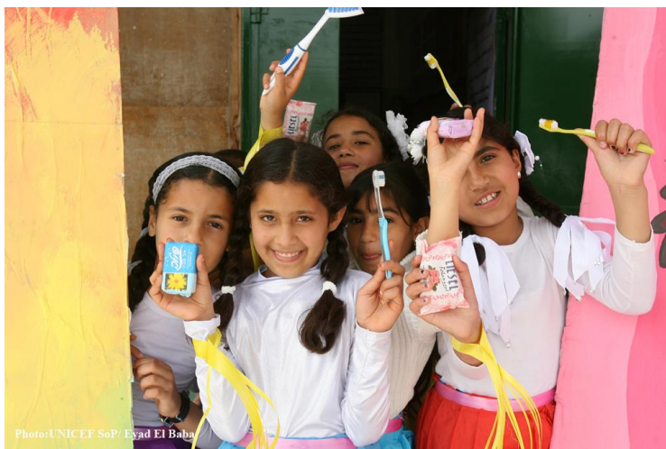
Hand washing and hygiene awareness activity in a school in Khan Younis supported by UNICEF

Three power generators of 110 KVA each were procured and delivered to CMWU, which installed them in the sewage pumping stations of Moghraqa, Zawaida and Bani Suhaila, substituting the old ones. 30,000 inhabitants will benefit from water pumping services during electricity black-outs, and improve risk prevention of floods.