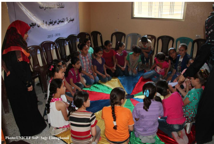
Sheja'iyeh, east of Gaza City – Children participate in life skills activities in one of the Family Centres supported by UNICEF

As part of its efforts to strengthen child protection and social welfare systems, a case management process has been launched in Gaza with UNICEF support which includes registration, comprehensive assessment, planning, and follow-up over a period of weeks. The Ministry of Social Affairs Child Protection Networks, Tamer and Ma'an Family Centers are now using the case management approach and receiving referrals for case management. UNICEF supported Family Centers and Child Protection Networks have reached 155 children (59 girls and 96 boys) with the case management approach so far.