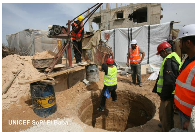
Al-Msaddar area, middle of Gaza Strip, workers installing a septic tank as part of UNICEF emergency project to rehabilitate sewage and water networks in the area

During the reporting period, 182 cubic meters of chlorine and 25 cubic meters of chemicals were distributed for piped water disinfection to WASH facilities, water wells and desalination units in the Gaza Strip. The rehabilitation and upgrading of water and wastewater networks in Khan Younis, Rafah and Middle Area is ongoing and will benefit 16,806 people. 36 families of the eastern parts of Rafah and Middle Area, who were affected by the summer conflict, benefitted from the installation and fixing of 36 septic tanks, preventing sewage flowing in the streets. The area is not connected to the public sewage system. 905 marginalized families in Rafah and Eastern villages of Khan Younis received 905 adult hygiene kits and 901 baby hygiene kits through ACF, with UNICEF support. In the Middle area, rehabilitation of one water well damaged by the