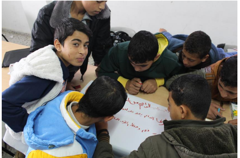
UNICEF partner Save Youth Future Society (SYFS): capacity building training for adolescents included diversified activities such as group work

UNICEF provides adolescents with capacity building opportunities to learn new skills and positively participate in the society. During the reporting period, 3,000 adolescents participated in an election process to choose 32 leaders (16 males and 16 females) who will receive leadership training; 168 literary sessions in the eight social fora have been conducted to enhance the adolescents' knowledge about the innovative tools of delivering messages of change and the culture of dialogue; 31 inspirational sessions were conducted. Twelve community discussion sessions were conducted in the reporting period, involving 300 participants (147 males and 153 females). Over 15 networking visits were conducted with Youth Oriented Organizations. UNICEF and its partner Ma'an finalized the design of and launched the E-Magazine. The magazine covers social issues of adolescents' concern, including environment and training, early marriage, youth participation, violence: it will be continually updated by the selected committee of adolescents who monitor and edit all the published pieces. UNICEF and its partner Injaz reached 3,048 adolescents in West Bank and Gaza through entrepreneurship training and activities. During the period, in total, 4,421 vulnerable households benefited from the e-voucher program. 12,136 school age children belonging to the beneficiary households were able to redeem their school uniforms, shoes and warm clothes.