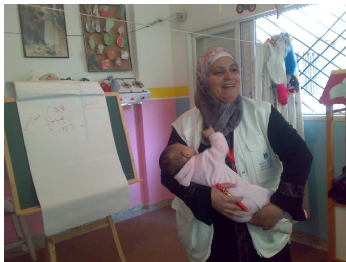
A MoH nurse is giving a breastfeeding counseling session in one of the UNICEF supported family centers in northern Gaza

One half ton of medical consumables (0.05ml and 0.5ml syringes) were delivered to the warehouses of the Ministry of Health (MoH) in the Gaza Strip during the reporting period in order to support the vaccination programme. 688 women and their new-borns were reached in the Gaza Strip through the post-natal home visit programme during the reporting period. The programme supports mothers and babies with post-natal care. 1,438 women living in homes and IDP shelters in the Gaza Strip benefited from awareness sessions on exclusive breastfeeding, communicable diseases prevention and hygiene. The neonatal mortality at Shifa neonatal department, in Gaza City, continues to decrease and now stands at 4.3%, thanks to UNICEF support funded by the Government of Japan of refurbishment of incubators. Before the refurbishment, the rate was standing at 30%.