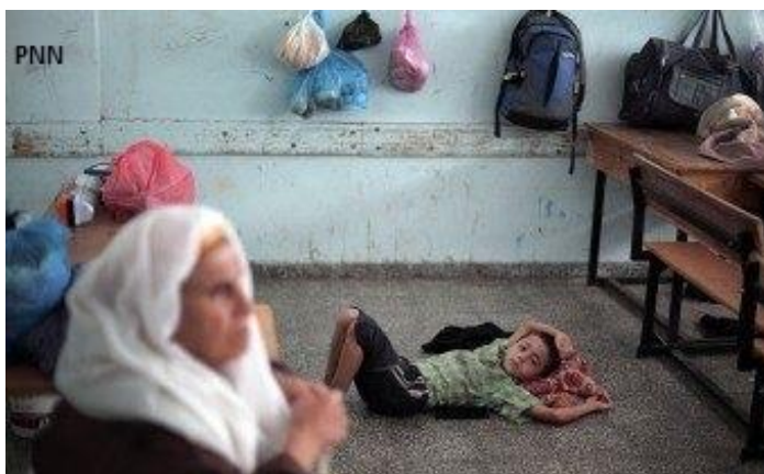
Education, Reconstruction & Psychosocial Support in Gaza, through a jointly implemented programme by UNICEF, UNRWA and UNDP

UNICEF supported the Palestinian Centre for Democracy and Conflict Resolution (PCDCR), Tamer Institute for Community Education, and Ma'an Development Center to continue providing psychosocial assistance to children and caregivers in Gaza. Since 1 January 2015, 24,769 children (12,481 girls and 12,288 boys) benefited from structured group activities, individual counselling and specialized mental health services. This includes 188 children (83 girls and 105 boys) who were reached by the Gaza Community Mental Health