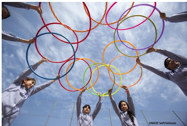
Recreational activities in Al Khader School, West Bank

UNICEF's Adolescents programme aims at enabling the development of adolescents and their participation in the community and society as active actors of positive change, by providing basic non-cognitive skills-building trainings and extra-curricular activities, including initiatives planned and developed by the adolescents at community level. During the reporting period, UNICEF partner Ma'an Development Center reached 1,456 adolescents as part of the Active Citizenship Group programme. The second phase of the PalVision programme, "Palestinian marginalized adolescents as leaders of community change" has started. Since January 2015, UNICEF and its partners Al Nayzak, Ma'an, Injaz and PalVision, have reached 21,782 adolescent boys and girls in the West Bank and Gaza, as part of the