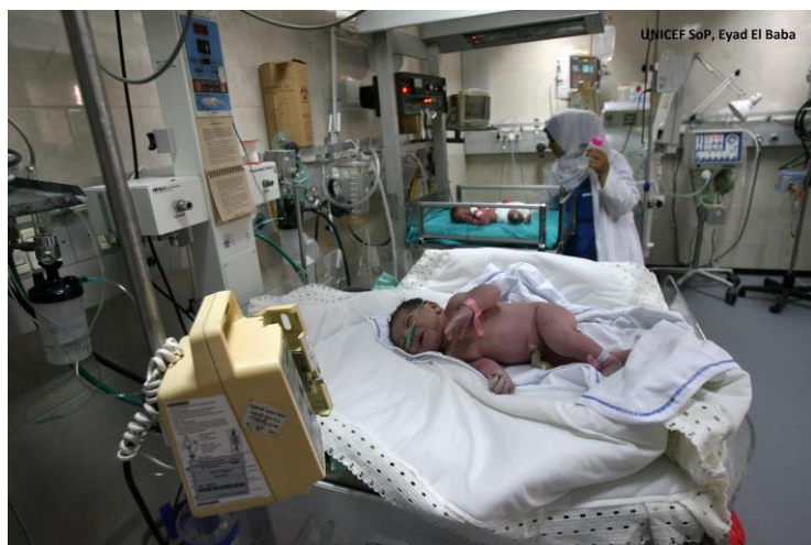
Al-Shifa hospital's Neonatal Intensive Care Unit, in Gaza City. The unit was renovated and equipped by UNICEF, which supported the provision of incubators and life-saving machines for new-borns. Since the unit started functioning, new-born's mortality rate has dropped from 35% to 7%.

As a part of supporting the process of polio eradication, the preparation phase for the capacity building component on achieving high quality “acute flaccid paralysis (AFP)” surveillance system is ongoing. Over 200 physicians and paediatricians working in paediatric hospitals, Primary Health Care (PHC) centres and PHC clinics will be involved in a training aiming at enhancing knowledge, skills and attitudes of paediatricians on AFP surveillance system in Gaza. The training phase is scheduled to take place in May 2015.