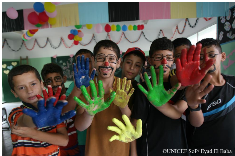
Khan Younis, southern Gaza Strip – Students from MoEHE Abu Baker elementary school participate in extracurricular activities supported by UNICEF during the summer break.

An agreement was signed with the Ecumenical Accompaniment Programme in Palestine and Israel (EAPPI), World Council of Churches to provide protective presence at checkpoints and gates with a view to protecting school children. The number of children and teachers that reach school safely are monitored and incidents are reported; the data is disaggregated by school, check point and sex. Information is shared with protection partners, international and local organisations for advocacy purposes and legal and psychosocial follow-up. During this new 2015-2016 school year approximately 3,800 children (30 percent girls) and over 300 teachers will be provided with protective accompaniment to enable safe and timely access to 26 schools.