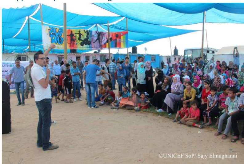
Khuzaa village, southern Gaza Strip – Displaced children are participating in the International Youth Day celebration with help from UNICEF’s adolescent partners and adolescent volunteers.

UNICEF, through Al Nayzak, Ma’an, Pal Vision, SYFS and Tamer, provides adolescents with capacity building trainings and opportunities to positively participate in the society. A total of 26,971 adolescents (59 percent female) have participated in 2015. Various activities were undertaken during the reporting period, and 963 new adolescents joined the programme and received training in 21st century skills. Some adolescents are receiving training in social media and advocacy. A number of the trained adolescents organized open days for other adolescents, parents, community members, and decision-makers. The groups presented their initiatives, the reasons behind the selection of the chosen issues, and the planned activities to address the problems. The adolescents engaged in dialogue with decision-makers about their issues. 29 community initiatives were implemented by adolescents.