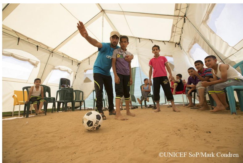
Khuzaa village, southern Gaza Strip - Displaced children who live in metal caravans in the village of Khuzaa' are participating in a recreational activity in a UNICEF supported Family Centre setup in a tent.

A total of 43,573 children (21,572 girls and 22,001 boys) and 26,168 caregivers (17,668 females and 8,500 males) received explosive remnants of war risk education through radio spots and awareness raising in Family Centres. Over 95,004 governmental primary school children across the Gaza Strip received ERW risk education as part of their school curriculum.