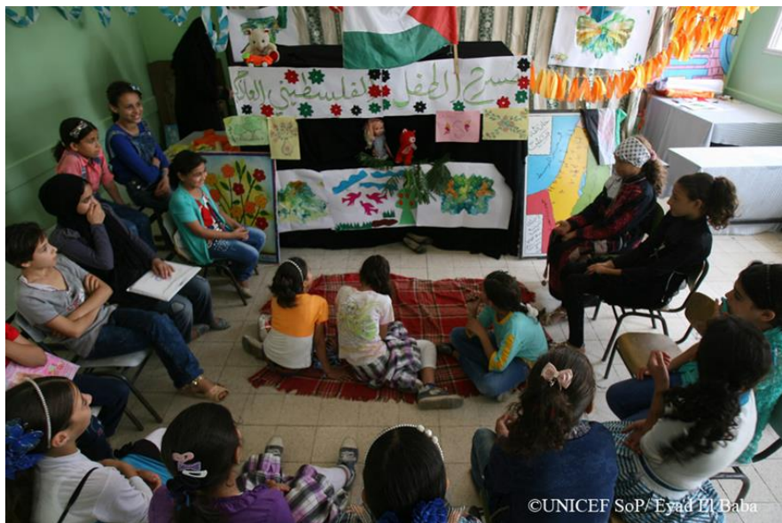
Above: Khan Younis, southern Gaza Strip – adolescent girls are watching a puppet show organized as part of extracurricular summer activities.

and other countries to return. The crossing has been continuously closed since October 2014, except for 29 days of partial openings. There is no regular schedule for the opening, and the limited days affect provision of humanitarian assistance.