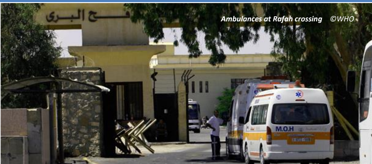
Ambulances at Rafah crossing