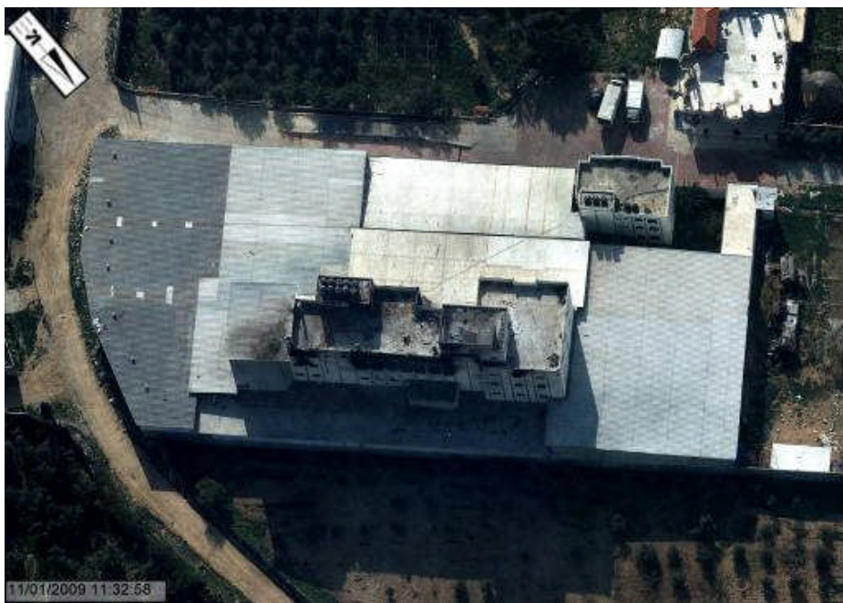
► El-Bader flour mill, 11 January 2009, following alleged incident

171. The Military Advocate General found that, in the specific circumstances of combat, and given its location, the flour mill was a legitimate military target in accordance with the Law of Armed Conflict. The purpose of the attack was to neutralize immediate threats to IDF forces.